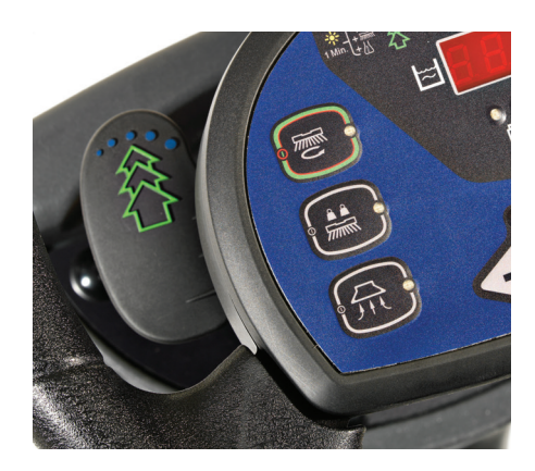
One paddle activates & de-activates the Ecoflex system