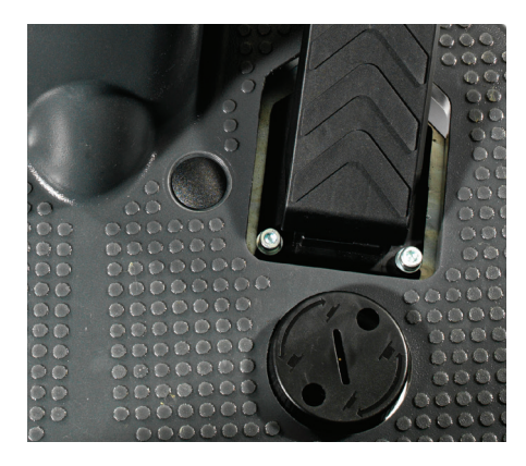
Fully adjustable traction pedal can be aligned with the operators choice of driving position