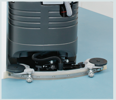
The squeegee does not swing, (it moves only when hitting obstacles) so it perfectly follows the deck/water track and guarantees complete water pick-up, even on tight turns, without leaving any trace