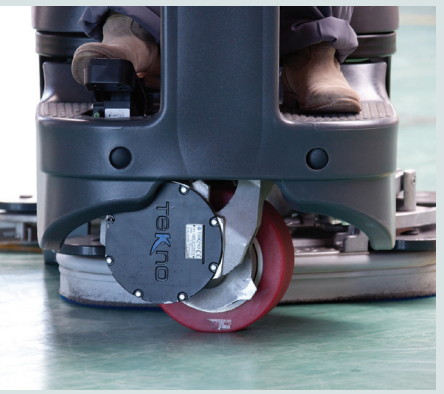
Deck system (linked to the steering wheel): when turning the steering wheel on the left, deck is moving on the left as well (same on the opposite side); it guarantees the best cleaning performance with maximum comfort and minimum effort. The water track is completely covered by the squeegee and side skirts are no longer required